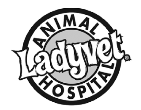
Your pet's "Health and Happiness" is our priority